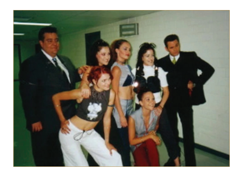
Good News Week Backstage - Channel 10