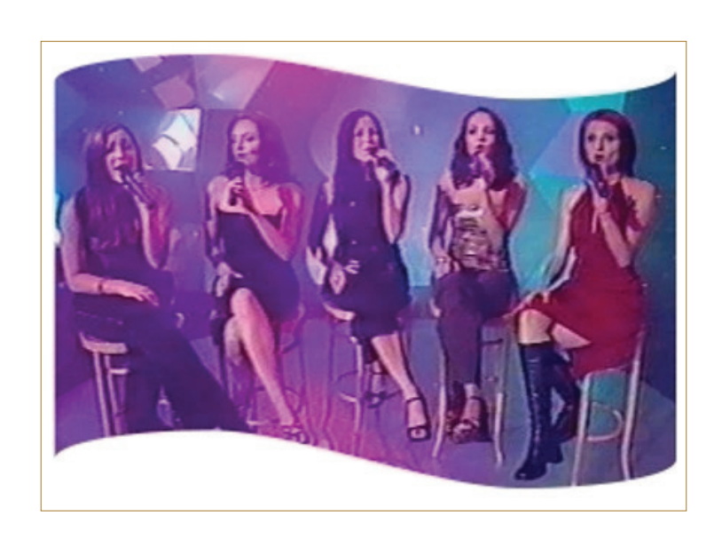
Channel 10 TV Performance