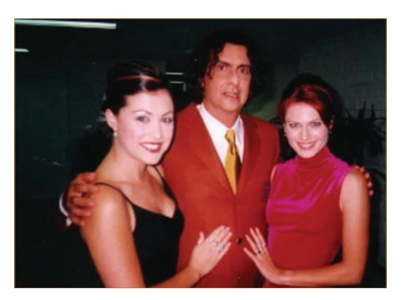
Backstage with the Sandman