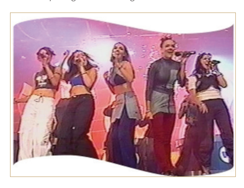
Good News Week Debut Performance